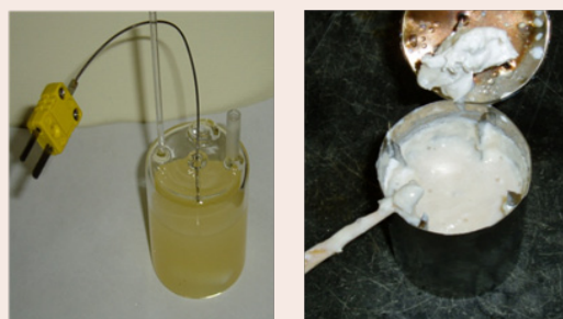
Figure 3. Example Test Cells for H 2 O 2 Contamination Study (left) and Emulsion Polymerization (right)