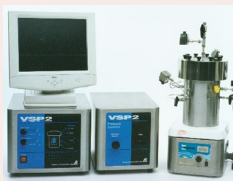
Figure 1. Basic VSP2 system

* Design Institute for Emergency Relief Systems, a subgroup of the American Institute of Chemical Engineers