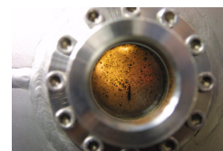
Sight Lens, 20-L Chamber

However, since the whole concentration range has not been tested sufficiently the maximum over pressure and maximum rate of pressure rise are not determined, so this method cannot be used for vent sizing or explosion suppression strategy design.